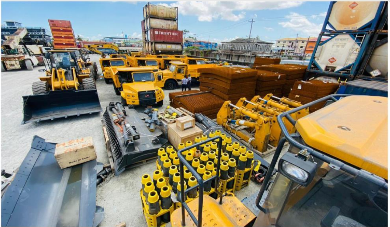
Operations at John Fernandes Port in Guyana